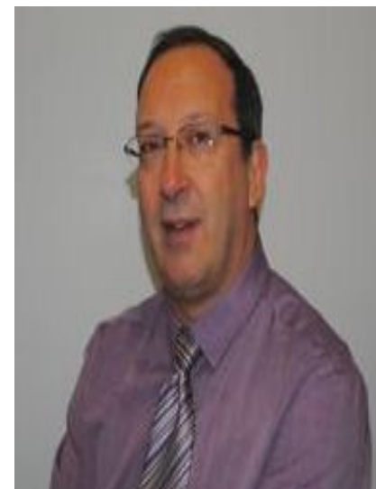
Mr K Baldwin SEN Governor